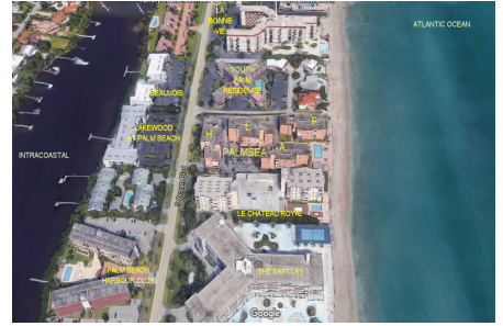
Built in 1973 - 121 units - 5 floors