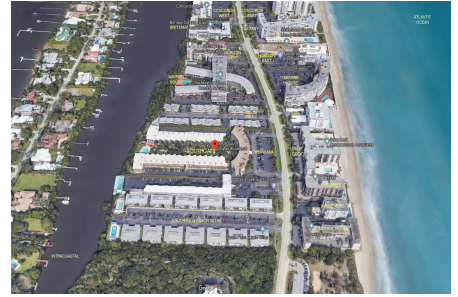
Built in 1974 - 128 units - 5 floors

Number of units: 128 Number of active listings for rent: 2 Number of active listings for sale: 6 Building inventory for sale: 4% Number of sales over the last 12 months: 6 Number of sales over the last 6 months: 4 Number of sales over the last 3 months: 1 Southgate Condominium Association Inc 3605 South Ocean Boulevard Office South Palm Beach, FL 33480 (561) 588-0153 https://