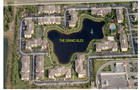
Built in 2005 - 320 units - 3 floors

Grand Isle Apartments 4145 Haverhill Road N West Palm Beach, FL33417-8119 (561) 687-7952 - (561) 687-7912 Gables Grand Isle 4197 Haverhill Road N West Palm Beach, FL33417-8183 (561) 687-7944 https://