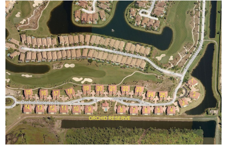
Built in 2005 - 100 units - 2 floors