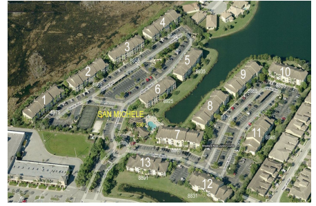
Built in 2006 - 300 units - 3 floors

Number of units: 300 Number of active listings for rent: 0 Number of active listings for sale: 1 Building inventory for sale: 0% Number of sales over the last 12 months: 3 Number of sales over the last 6 months: 0 Number of sales over the last 3 months: 0 San Michele Andros Isle 8901 Okeechobee Boulevard West Palm Beach, FL33411-1826 (561) 753-4727 https://