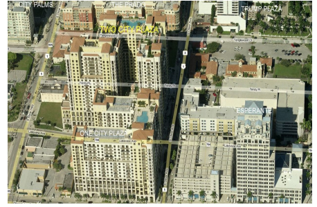
Built in 2008 - 448 units - 20 floors