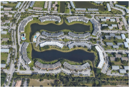
Built in 1971 - 560 units - 4 floors