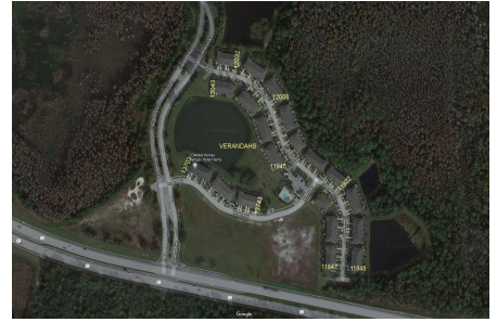
Built in 2015 - 116 units - 2 floors