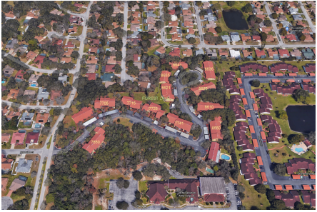
Built in 1981/1987 - 88 units - 2 floors