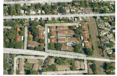
Built in 1986 - 108 units - 1 floor

Azalea Woods Condominium Association 3455 Countryside Blvd FIRST CHOICE ASSOCIATION MANAGEMENT INC 4174 WOODLANDS PKWY PALM HARBOR 34685 PHONE 727-785-8887 FAX 727-787-5725 https://