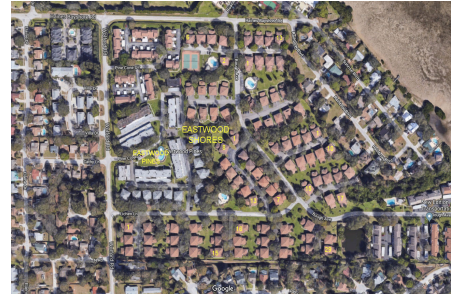
Built in 1979/1986 - 415 units - 2 floors

Eastwood Shores Condominium No 6 Associa 1810 Bough Avenue Clearwater, FL 33760 Phone: (727) 726-8000 https://eastwoodshores4.org/