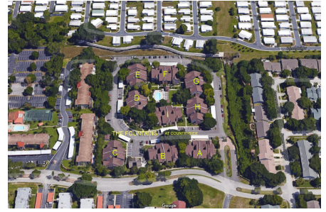
Built in 1987 - 168 units - 3 floors

Number of units: 168 Number of active listings for rent: 5 Number of active listings for sale: 9 Building inventory for sale: 5% Number of sales over the last 12 months: 14 Number of sales over the last 6 months: 7 Number of sales over the last 3 months: 4 The Fountains at Countryside Address: 2500 Winding Creek Blvd, Clearwater, FL 33761 Phone: +1 813-448-3981 https://www.facondos.com/