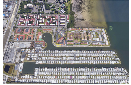
Built in 1969/1979 - 447 units - 7 floors

Number of units: 447 Number of active listings for rent: 4 Number of active listings for sale: 69 Building inventory for sale: 15% Number of sales over the last 12 months: 24 Number of sales over the last 6 months: 13 Number of sales over the last 3 months: 5 Imperial Cove/Assoc 19029 US Highway 19 N, Clearwater, FL 33764 (727) 531-3016 Imperial Cove Condos Association Address 1303 S Hercules Ave Clearwater, Florida 33764 Phone +1 727-531-1679 https://