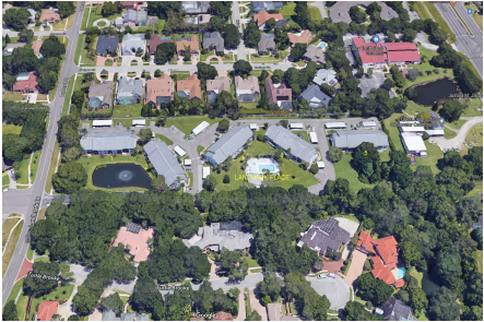
Built in 1984/1988 - 50 units - 2 floors