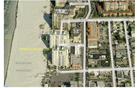
Built in 2002 - 91 units - 16 floors

https://mbcmanager@themandalaybeachclub.com