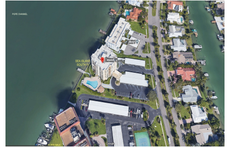
Built in 1975 - 31 units - 8 floors

Number of units: 31 Number of active listings for rent: 0 Number of active listings for sale: 5 Building inventory for sale: 16% Number of sales over the last 12 months: 0 Number of sales over the last 6 months: 0 Number of sales over the last 3 months: 0 Sea Island South Condo IV Address: 750 Island Way, Clearwater, FL 33767 https://