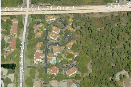
Built in 1984 - 108 units - 2 floors