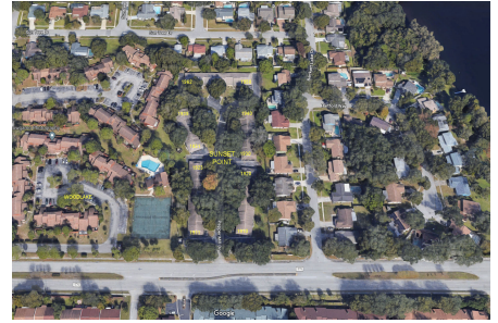
Built in 1983 - 31 units - 1 floor