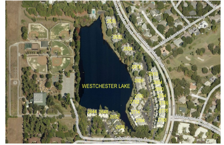
Built in 1983 - 125 units - 2 floors

WESTCHESTER LAKE CONDOMINIUM ASSOCIATION, INC. AMERI-TECH REALTY INC 24701 US HIGHWAY 19 N STE 102 CLEARWATER FL 33763 PHONE 727-726-8800 FAX 727-723-1101 https://