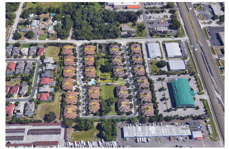
Built in 2006 - 88 units - 2 floors