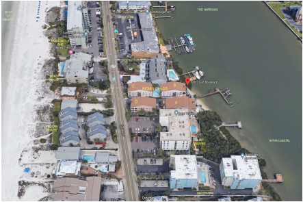
Built in 1981 - 16 units - 3 floors

Number of units: 16 Number of active listings for rent: 0 Number of active listings for sale: 3 Building inventory for sale: 18% Number of sales over the last 12 months: 1 Number of sales over the last 6 months: 1 Number of sales over the last 3 months: 1 Indian Sands Condominium Association, Inc. Address: 19937 Gulf Blvd C, Indian Shores, FL 33785 https://