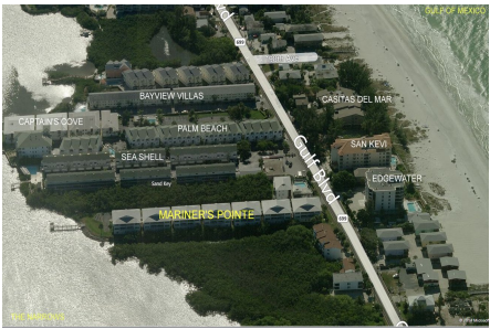
Built in 2001 - 30 units - 3 floors