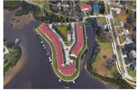
Built in 2003 - 67 units - 3 floors