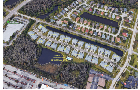
Built in 1998 - 78 units - 2 floors

Number of units: 78 Number of active listings for rent: 0 Number of active listings for sale: 1 Building inventory for sale: 1% Number of sales over the last 12 months: 3 Number of sales over the last 6 months: 1 Number of sales over the last 3 months: 0 Sun Ketch Townhomes at Cypress Lakes Homeowners Association, Inc The Melrose Management Partnership 3527 Palm Harbor Blvd Palm Harbor, FL 34683 727-787-3461 (phone) 727-787-3423 (fax) https://melrosecorporation.com/sun-ketch-townhomes-cypress/