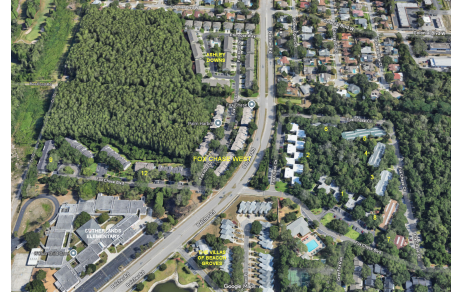
Built in 1981/1987 - 190 units - 2 floors

Number of units: 192 Number of active listings for rent: 2 Number of active listings for sale: 17 Building inventory for sale: 8% Number of sales over the last 12 months: 6 Number of sales over the last 6 months: 3 Number of sales over the last 3 months: 3 Fox Chase West Property Owners Association Phone: 727-789-2466 https://www.foxchasepropertyowners.com/