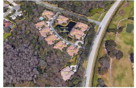
Built in 1997/2000 - 40 units - 2 floors

Number of units: 40 Number of active listings for rent: 0 Number of active listings for sale: 5 Building inventory for sale: 12% Number of sales over the last 12 months: 3 Number of sales over the last 6 months: 1 Number of sales over the last 3 months: 1 Lansbrook Master Association Address: 5025 Highpoint Dr, Palm Harbor, FL 34685 Phone: +1 727-943-7076 https://lansbrooktampabay.com/