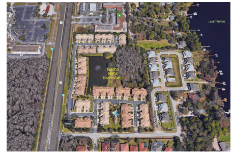
Built in 2007/2013 - 80 units - 2 floors