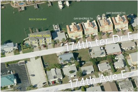
built in 2006 - 3 units - 3 floors