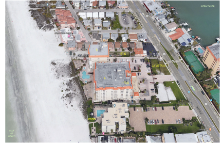
Built in 2006/2015 - 47 units - 8 floors

Number of units: 47 Number of active listings for rent: 0 Number of active listings for sale: 1 Building inventory for sale: 2% Number of sales over the last 12 months: 2 Number of sales over the last 6 months: 2 Number of sales over the last 3 months: 1 La Vistana Condominium Association, Inc. Address: 17720 Gulf Blvd, Redington Shores, FL 33708 https://