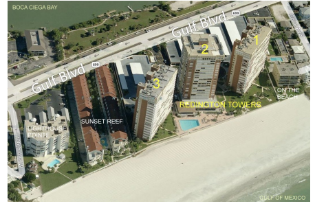
Built in 1974 - 156 units - 20 floors

REDINGTON TOWERS CONDOMINIUM ASSOCIATION, INC. PROFESSIONAL BAYWAY MANAGEMENT COMPANY 5901 SUN BLVD STE 203 ST PETERSBURG FL 33715 727-866-3115 https://