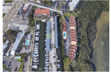
Built in 1985 - 35 units - 4 floors