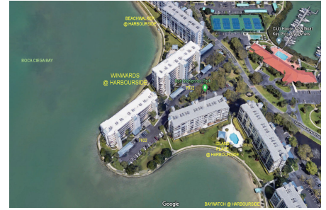
Built in 1988 - 108 units - 9 floors