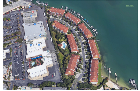
Built in 1995/1998 - 75 units - 3 floors