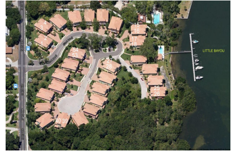
Built in 2004 - 53 units - 2 floors