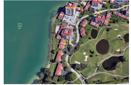
Built in 1978 - 64 units - 6 floors