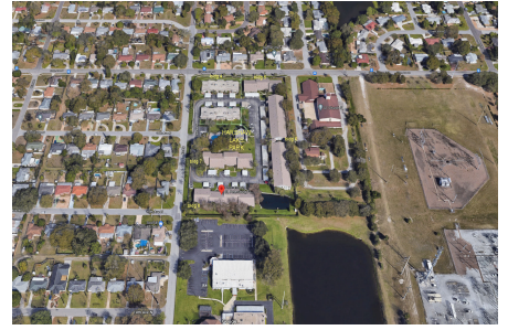
Built in 1971/1984 - 63 units - 2 floors