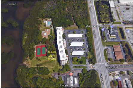
Built in 1985 - 112 units - 8 floors