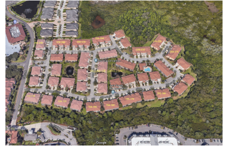
Built in 2004/2007 - 165 units - 2 floors