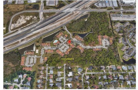
Built in 1986 - 248 units - 2 floors

Number of units: 248 Number of active listings for rent: 3 Number of active listings for sale: 7 Building inventory for sale: 2% Number of sales over the last 12 months: 9 Number of sales over the last 6 months: 3 Number of sales over the last 3 months: 0 Windjammer Condominium Association Address: 1400 Gandy Blvd N, St. Petersburg, FL 33702 Phone: +1 727-579-7920 ext. 113 https://PinellasStPetersburg1400GandyBlvd