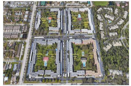
Built in 1972 - 114 units - 3 floors

Winston Park Northeast Address: 5085 1st St NE, St. Petersburg, FL 33703, Phone: +1 727-528-7019