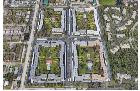
Built in 1972 - 114 units - 3 floors

Number of units: 114 Number of active listings for rent: 0 Number of active listings for sale: 3 Building inventory for sale: 2% Number of sales over the last 12 months: 0 Number of sales over the last 6 months: 0 Number of sales over the last 3 months: 0 Winston Park Northeast Address: 5085 1st St NE, St. Petersburg, FL 33703, Phone: +1 727-528-7019 https://