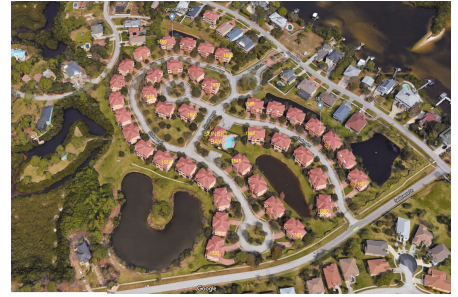
Built in 2006 - 80 units - 1 floor

https://www.sunsetbaytoday.org/sunsetbayfl/outside_home.asp