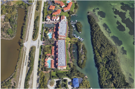
Built in 2001 - 57 units - 5 floors