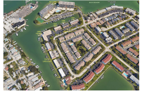
Built in 1972/1980 - 43 units - 3 floors