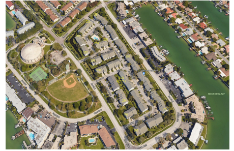
Built in 1985/1989 - 97 units - 2 floors