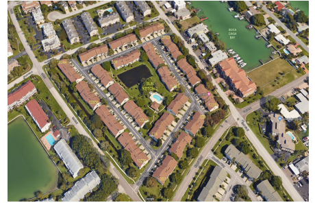
Built in 1988 - 111 units - 2 floors