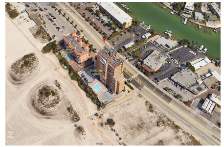
Built in 1974 - 46 units - 15 floors

Number of units: 46 Number of active listings for rent: 0 Number of active listings for sale: 5 Building inventory for sale: 10% Number of sales over the last 12 months: 1 Number of sales over the last 6 months: 0 Number of sales over the last 3 months: 0 Treasure Sands Condominium Address: 11000 Gulf Blvd, Treasure Island, FL 33706 Phone: +1 727-367-2029 https://