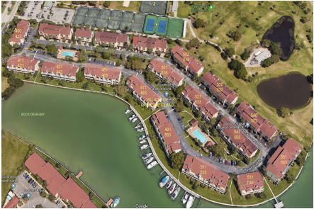
Built in 1980 - 98 units - 3 floors