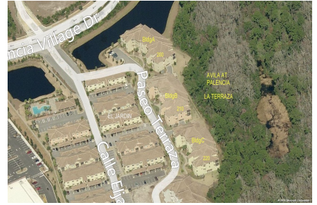
Built in 2006 - 57 units - 4 floors

AVILA AT PALENCIA MASTER ASSOCIATION, INC. FLAGLER PALM COAST PROPERTY MANAGEMENT 50 LEANNI WAY STE B6 PALM COAST FL 32137 386-445-9282