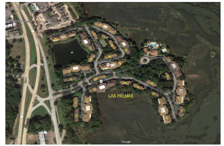
Built in 2000 - 328 units - 2 floors

Number of units: 328 Number of active listings for rent: 2 Number of active listings for sale: 4 Building inventory for sale: 1% Number of sales over the last 12 months: 8 Number of sales over the last 6 months: 4 Number of sales over the last 3 months: 3 Las Palmas Condominium Complex Address: 1090 Bella Vista Blvd, St Augustine, FL 32084, Phone: +1 904-826-0019 https://