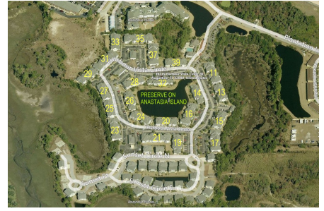
Built in 2000 - 328 units - 2 floors

Management Company for The Preserve on Anastasia Island Condominium 661 A1A Beach Blvd. St. Augustine Beach, FL 32080 (904) 471-5818 Office (904) 471-7441 Fax https://staugpreserve.com/